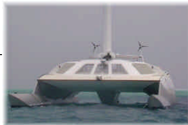
Custom Projects are our Specialty

Final Design usually proceeds after a builder is selected and the client has determined that the project is financially feasible. Most often the construction process starts before the final design is complete. Obviously we try to stay a couple steps ahead of the builder so that the construction process can proceed smoothly.